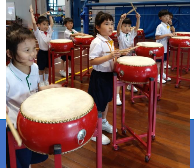
Mother Tongue Fortnight