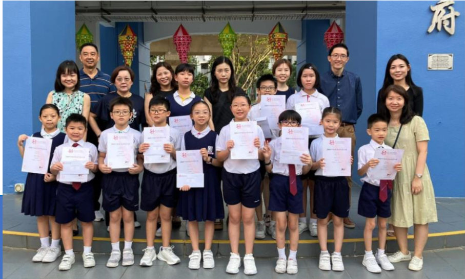
Participation in Mother Tongue Competitions