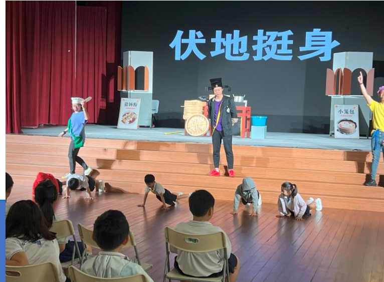
Learning journeys to language related cultural performances